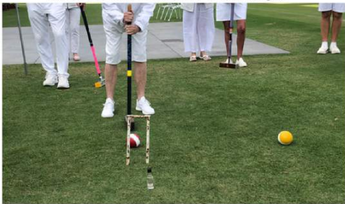
Hit the rum bottle and it's yours!