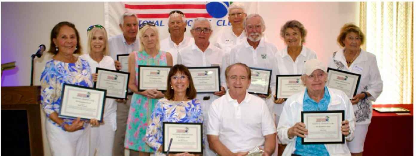
2022-23 Volunteers Honored. See below.

THANKS TO ALL WHO ARE DONATING AND WORKING TO MAKE THESE PROJECTS HAPPEN! ALL WILL BE RECOGNIZED.