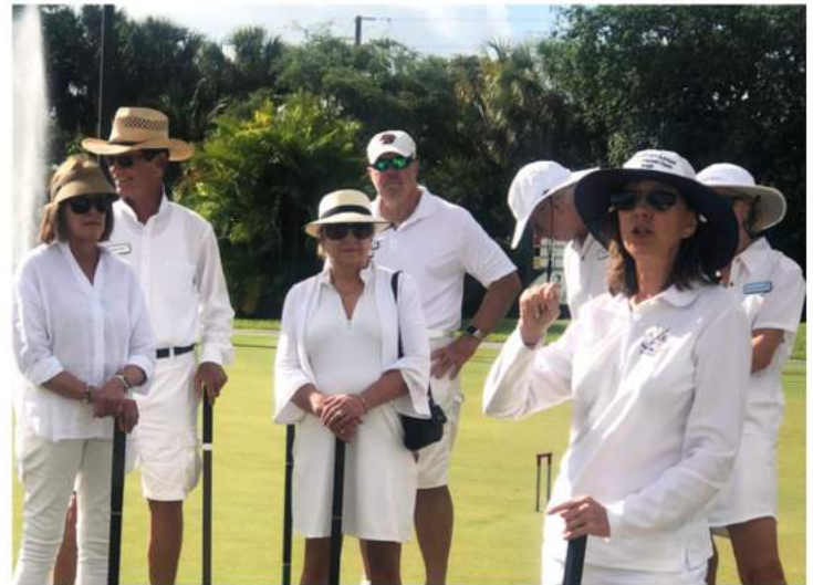
Strikers get a lesson

The upcoming New Member Mixer is on May 7 at 2pm at the NCC