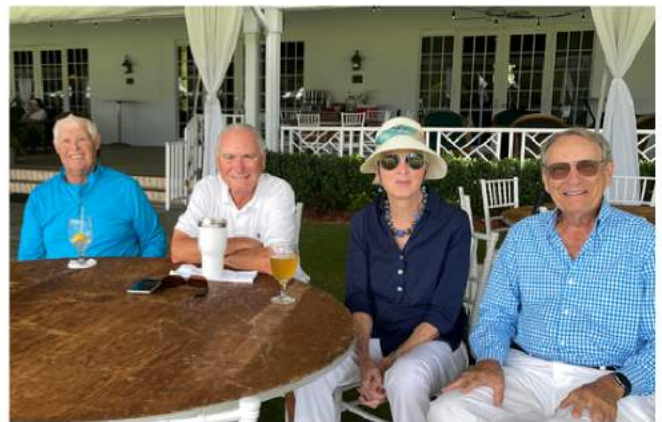
Cheering on the NCC Teams